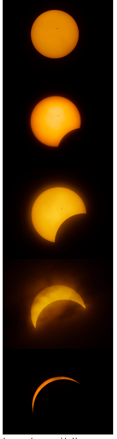
Images above provided by Dr. Jadhav, captured through the Canon EOS-RP at prime focus of a Stellarvue 125 Access scope.