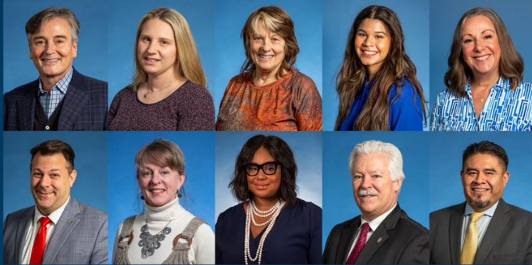
2023-24 Board of Trustees Recognized by ACCT